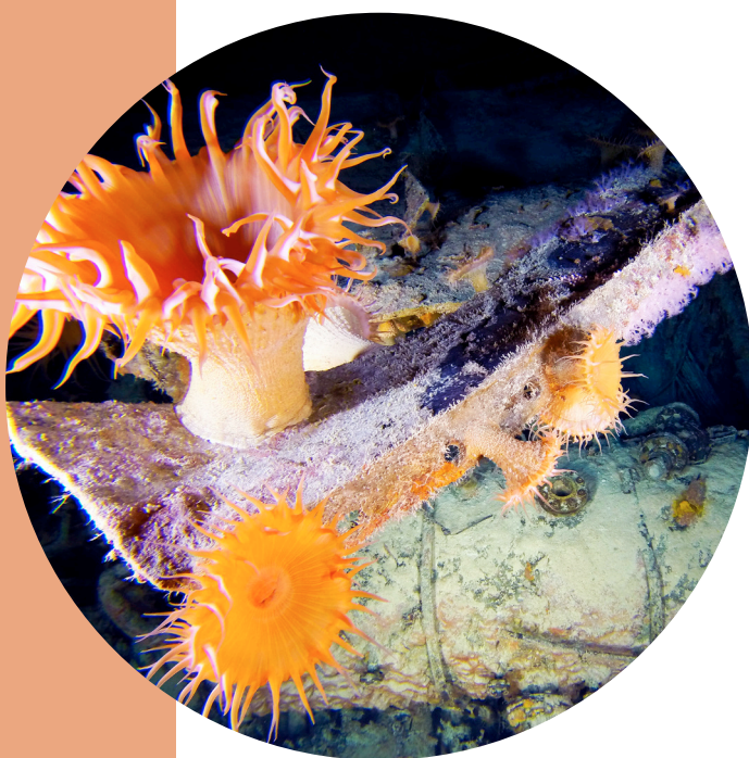
Image: Anemone growing on the wreckage of HSK Kormoran .