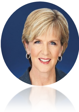
Hon Julie Bishop MP Deputy Chair