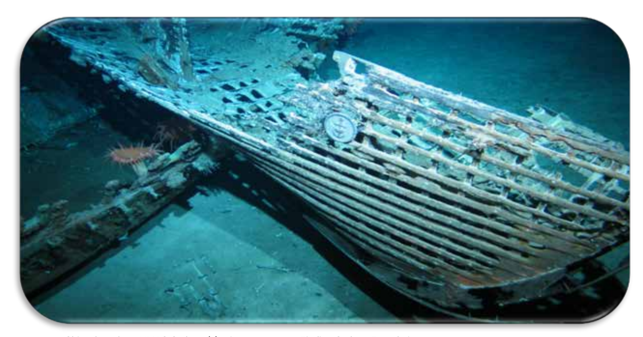
Ship's boat from HMAS Sydney (II)

The Foundation has been actively assisting the Museum to raise additional funds for the scheduled 2014-15 expedition to reinvestigate and reimage the wreck sites of the World War Two ships HMAS Sydney (II) and HSK Kormoran.